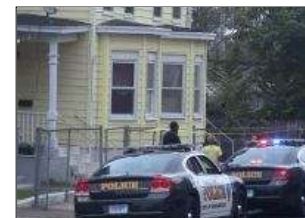
Police investigate homicide