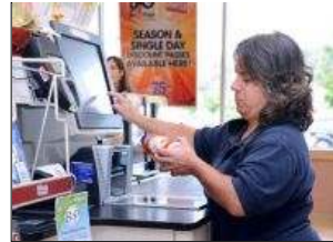
Man triumphs over machine

Just about all of the students, uncharacteristically for most, were dressed in what might be called business attire, the better to impress the dozen or so corporate executives on hand.