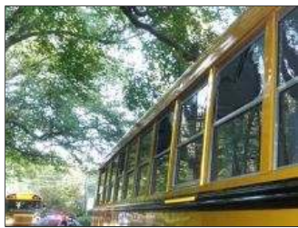
School bus hits tree branch in Westport, several students injured