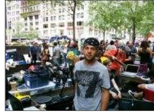
Protesting Wall Street